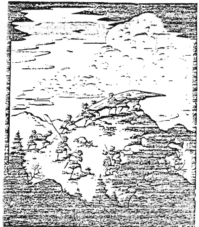
Carrying bateaux over the height of land