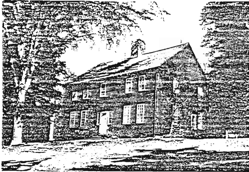
Major Reuben Colburn House (1765) A registered National Historic Landmark

The Colburn House, headquarters of the Arnold Expedition Historical Society, is the site of the shipyard of Major Reuben Colburn who constructed 220 bateaux for Col. Benedict Arnold's historic expedition to capture Quebec City in 1775. Replicas of the bateaux, constructed for the thrilling Re-enactment of the Expedition in 1975 as a Bicentennial event, are on display in the museum, along with other artifacts and historical data.