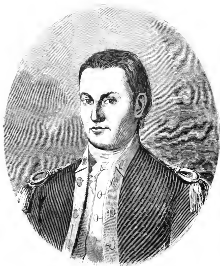
COL. CHRISTOPHER GREENE