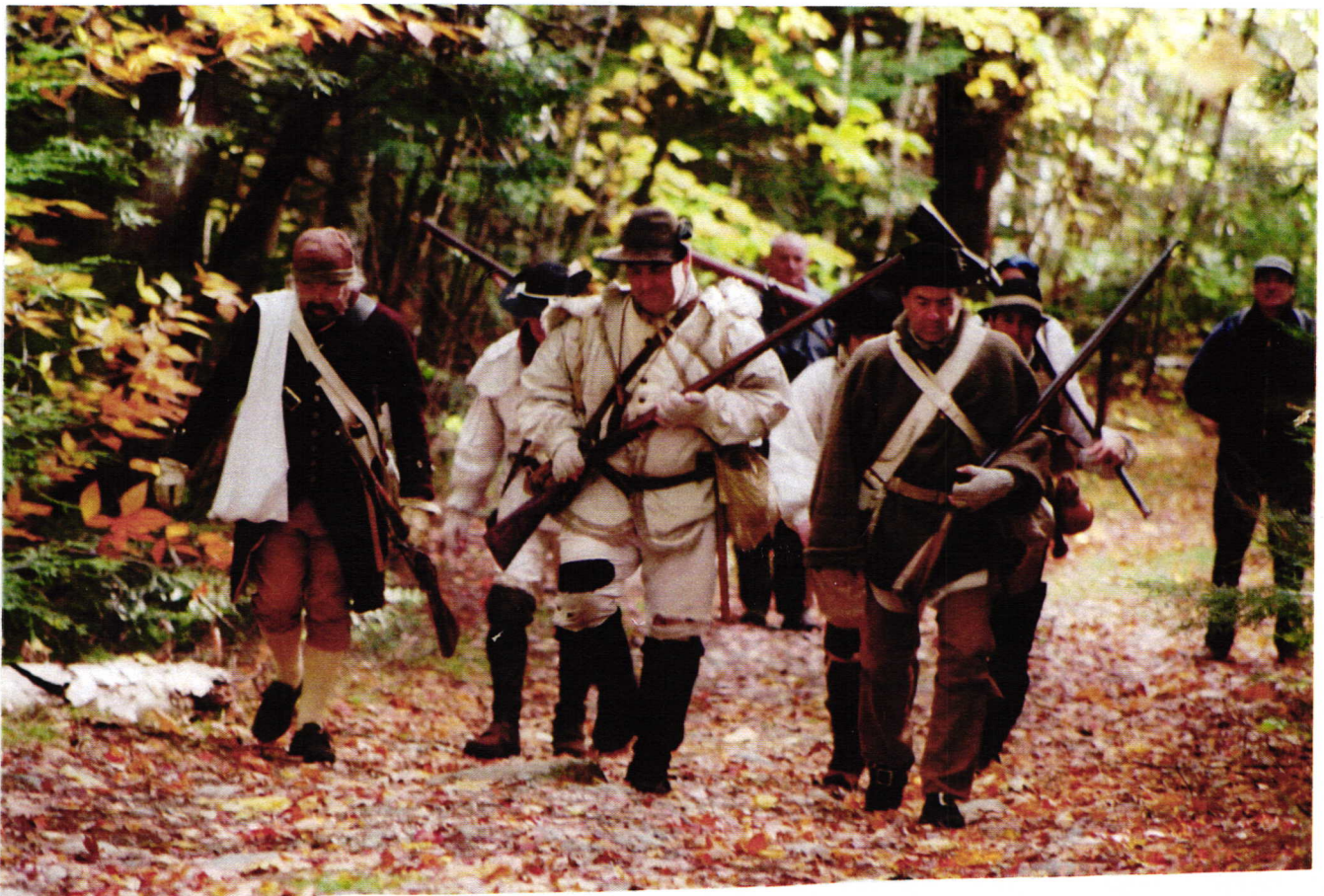
Above: Soldiers march along the Great Carrying Place Portage Trail.

Below: Soldiers reach the point where the portage trail disappears under Flagstaff Lake. Bigelow ("the forked mountain") is in the background. The end of old portage trail lies a half mile further under the impoundment at Bog Brook.