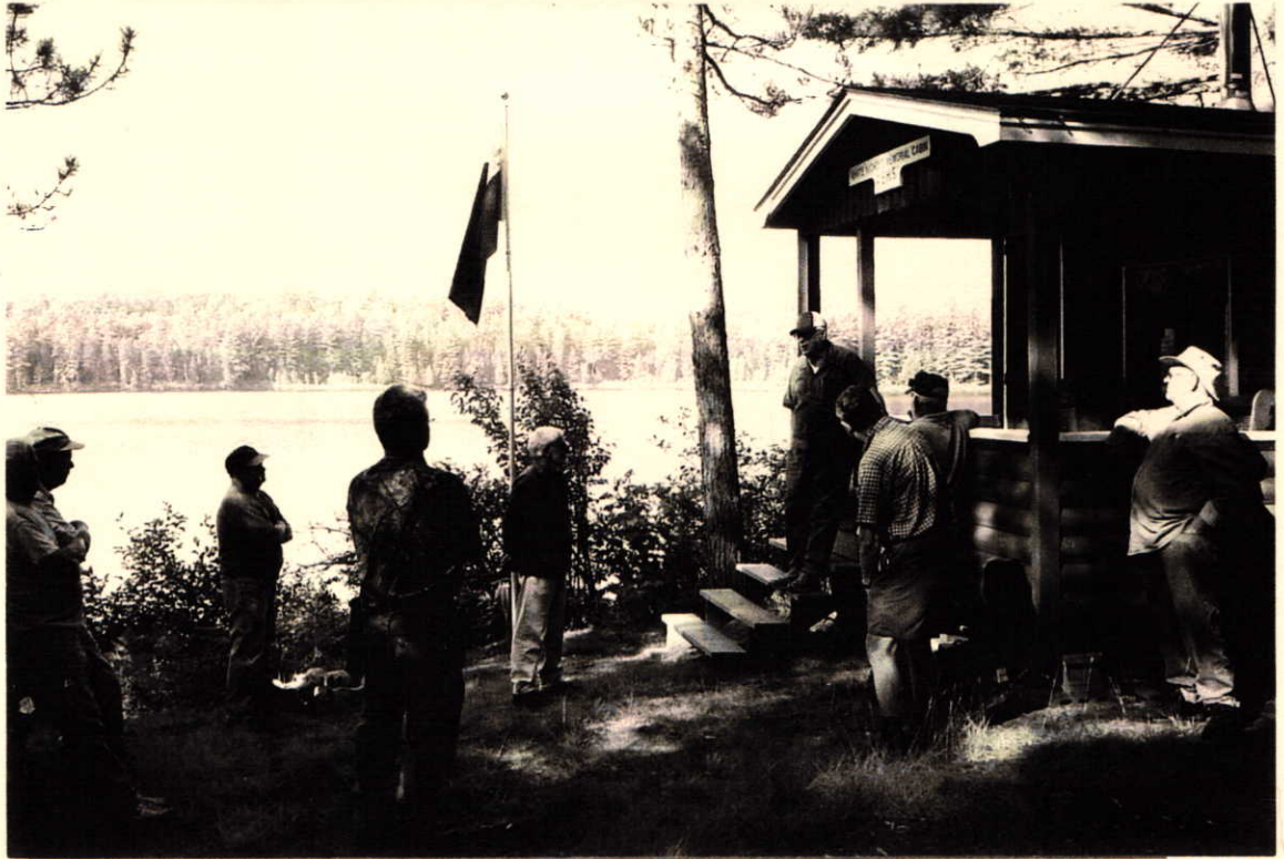
The 1775 Expedition Flag at the AEHS Nichols Cabin